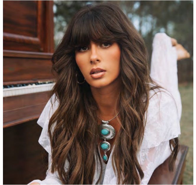
Ella Langley has found herself at the top of the MusicRow CountryBreakout Radio Chart once again this week, with "Be Her."