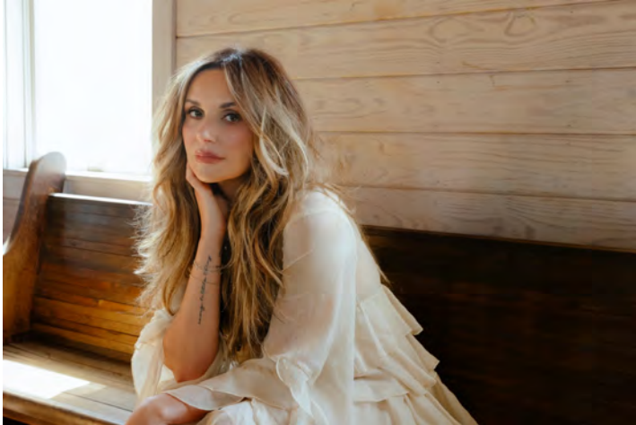
Carly Pearce.

Ballads dominate this edition of DISCLAIMER, but a few of the country stars are making toe-tapping sounds as well.