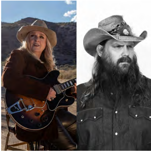
Melissa Etheridge & Chris Stapleton

Whether in romantic ballads or rollicking tempo tunes, there's a definite summertime feel in this week's country tracks.