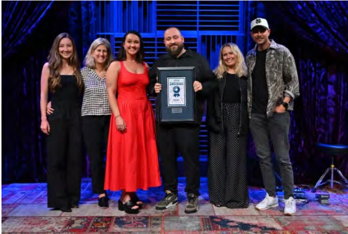
Big Loud Publishing Accepts Their Award for Top Independent Music Publisher of the Year.

The Association for Independent Music Publishers (AIMP) held its 2026 AIMP Nashville Country Awards earlier this week at Analog at the Hutton Hotel. Bringing together members of Nashville's music business in celebration, the annual event celebrated the successes of independent songwriters and publishers.