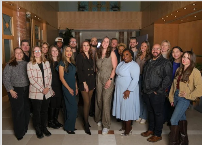
SOLID's 2026 Board of Directors.