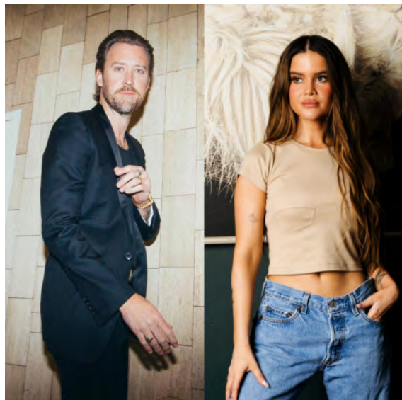
Charles Kelley & Maren Morris

Any playlist smorgasbord that includes such diverse talents as Megan Moroney, The Grascals and Jim Lauderdale is fine with me.