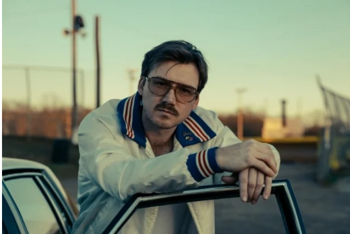
Morgan Wallen.

Morgan Wallen has been named RIAA's highest certified country artist of all time, as well as the third most-certified artist, all-genre (behind Drake and Taylor Swift for solo titles).