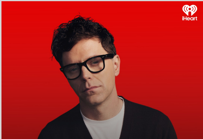
Bobby Bones.

iHeartMedia and Netflix have partnered in an exclusive video podcasting agreement for more than 15 original iHeartPodcasts. New video podcast episodes will launch on Netflix in early 2026 in the US, with more markets to follow.