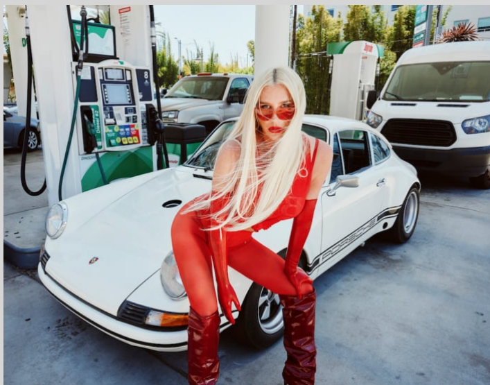
Kesha.