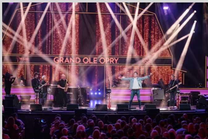
Better Than Ezra perform at the Opry.

Better Than Ezra made their Grand Ole Opry debut last Wednesday (Sept. 24).