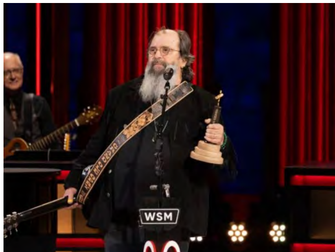
Steve Earle inducted in the Grand Ole Opry family.