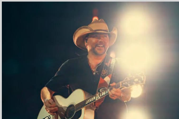
Jason Aldean.

BMG has acquired Jason Aldean's recorded music catalog. Additionally, the company has also acquired interests in the recorded catalogs and publishing rights of a music collection from 23 artists and songwriters, with the entire deal encompassing over 1,000 songs across multiple genres. The deal marks BMG's single largest catalog acquisition investment in company history.