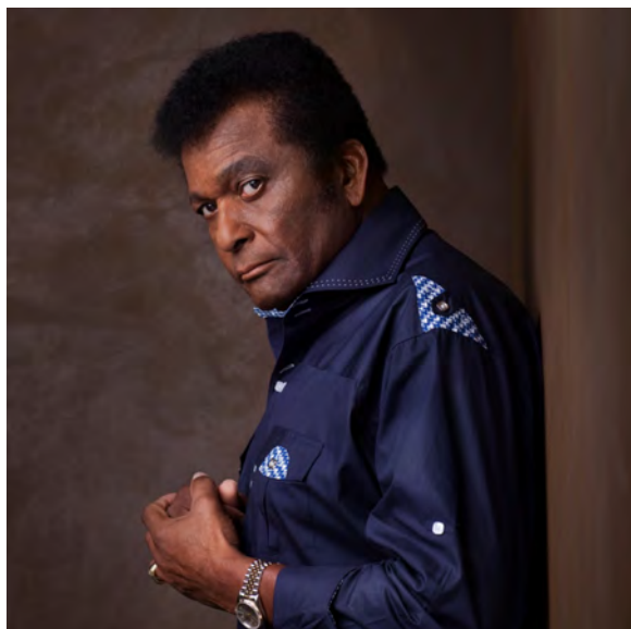
Charley Pride.

This edition of DISClaimer covers country sounds, but takes a few detours along the way.