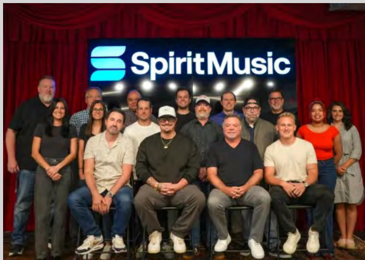
Hardy with the Spirit Music team and executives from Milom/Crow/Kelley/Beckett/Shehan PLC, Lyric Capital Group, Relative Music Group, TRACK mgmt and Safford Motley PLC.

Spirit Music has acquired select compositions from the music publishing catalog of country rock superstar HARDY . He has also signed a go-forward exclusive songwriting agreement with Spirit Music Nashville.