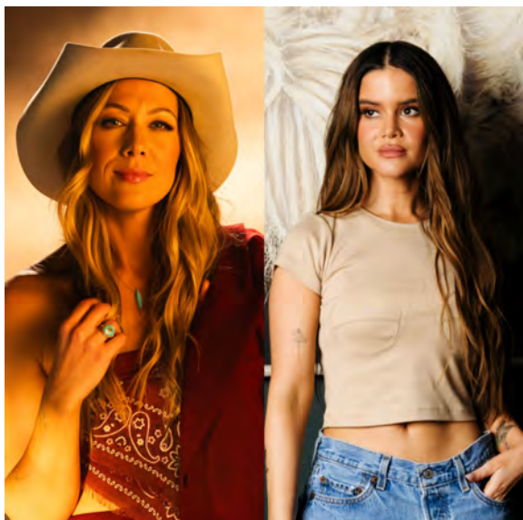
Colbie Caillat & Maren Morris

The ladies rocked this edition of DISClaimer.