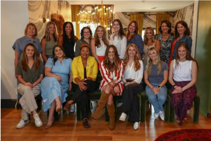
CMA Women's Leadership Academy Class of 2025.

The CMA has announced its newest class of participants for its 12-week Women's Leadership Academy.