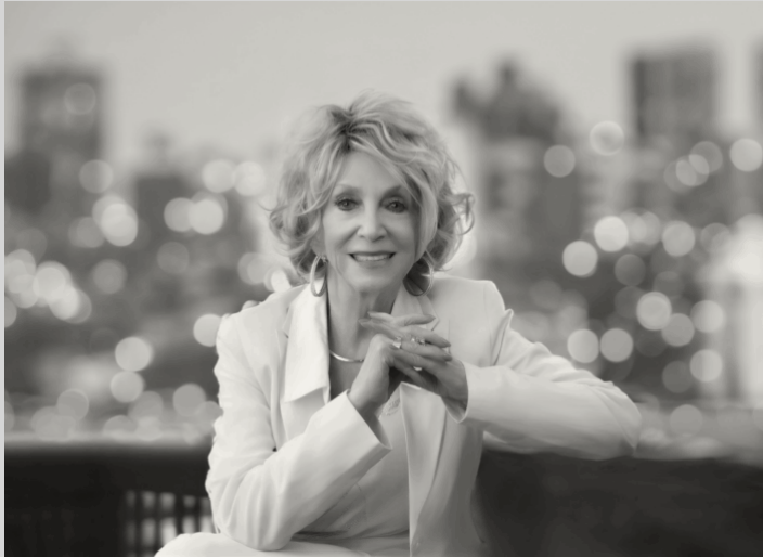
Jeannie Seely.

Jeannie Seely , the beloved Grand Ole Opry member whose voice, wit and longevity made her one of country music's most enduring figures, has died at age 85. She passed peacefully last Friday (Aug. 1) at 5:00 p.m. CT at Summit Medical Center in Hermitage, Tennessee, following complications from an intestinal infection.