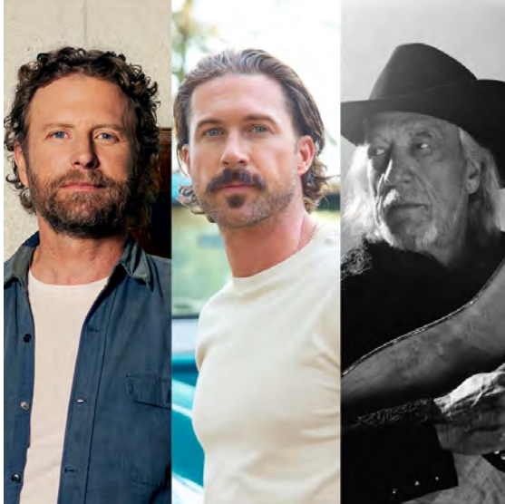
Dierks Bentley, Riley Green & John Anderson

The hallmarks of this edition of DISClaimer are ballads and collaborations.