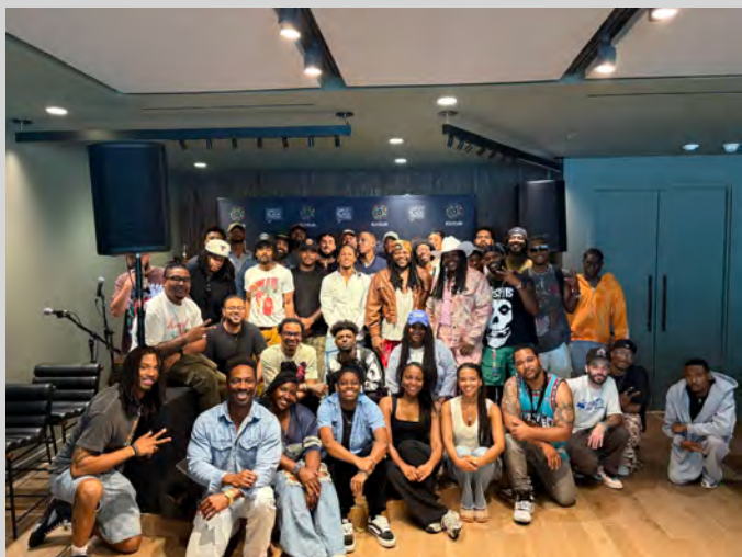
Kinfolk Nashville Writers Camp.

Kinfolk, an Employee Resource Group of Warner Music Group, hosted its inaugural Kinfolk Nashville Writers Camp, a three-day songwriting and industry intensive designed to amplify Black voices.