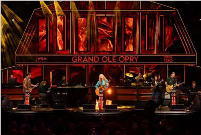
Southall makes their Grand Ole Opry debut.

Southall made their Grand Ole Opry debut last Wednesday (June 25), taking part in this year's historic Opry 100 celebration.