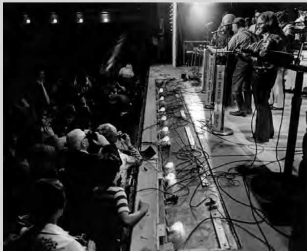
Grand Ole Opry’s final night at the Ryman Auditorium on March 15, 1974.

The Grand Ole Opry is set to return to its former home at the Ryman Auditorium on July 17. This performance is a tribute to the historic March 15, 1974 Grand Ole Opry broadcast, the final night of the Opry’s original Ryman run. Throughout that portion of the show, moments from the 1974 broadcast will be closely recreated for the Ryman and radio audiences.