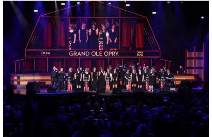
ACM Lifting Lives Music Camp.

ACM Lifting Lives recently hosted its 16th Annual ACM Lifting Lives Music Camp, held in collaboration with Vanderbilt Kennedy Center.