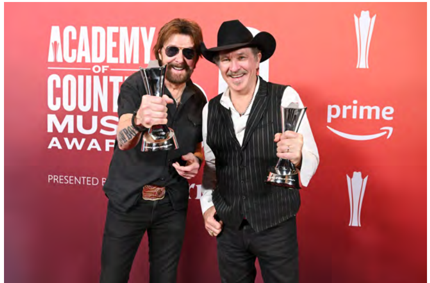
Ronnie Dunn, Kix Brooks of Brooks & Dunn at the 60th Academy Of Country Music Awards held at the Ford Center at The Star on May 08, 2025 in Frisco, Texas.