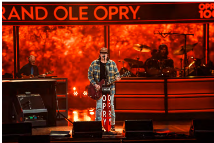
Hardy performs at the Grand Ole Opry.

Hardy made his Grand Ole Opry debut on Tuesday night (April 29). Lainey Wilson provided a video introduction before the singer-songwriter took the stage. During the debut, Ella Langley joined Hardy on stage for a performance of him and Wilson's hit "Wait In The Truck."