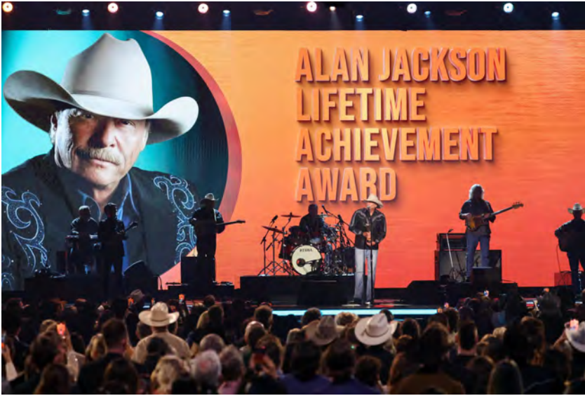
Alan Jackson onstage at the 60th Academy Of Country Music Awards held at the Ford Center at The Star on May 08, 2025 in Frisco, Texas.

Osborne honored Keith Urban with a tribute performance featuring “Stupid Boy,” “Blue Ain’t Your Color” and “Where the Blacktop Ends”—the latter featuring Urban himself joining in. Urban was recognized with the ACM Triple Crown Award, which celebrates artists who’ve won New Artist of the Year, Artist of the Year and Entertainer of the Year.