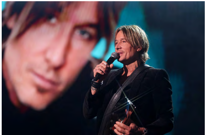
Keith Urban at the 60th Academy Of Country Music Awards held at the Ford Center at The Star on May 08, 2025 in Frisco, Texas.

Later in the show, Stapleton, Megan Moroney and Brothers