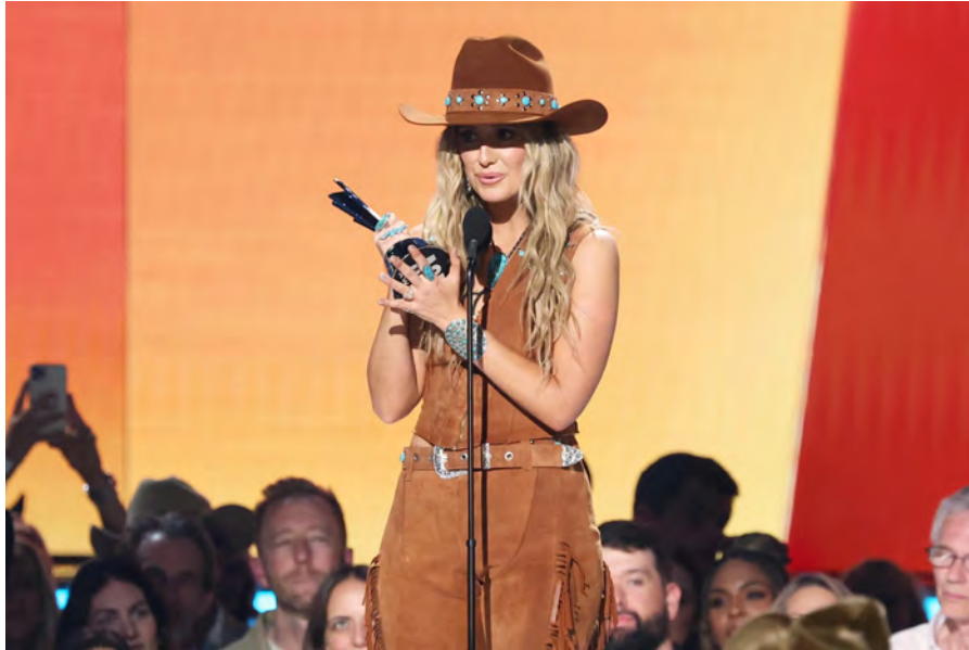
Lainey Wilson onstage at the 60th Academy Of Country Music Awards held at the Ford Center at The Star on May 08, 2025 in Frisco, Texas.

The 60th Academy of Country Music Awards took place last night (May 8), streaming live from The Ford Center at The Star in Frisco, Texas. Reba McEntire returned as host for the milestone event, which was broadcast internationally via Prime Video and the Amazon Music channel on Twitch.