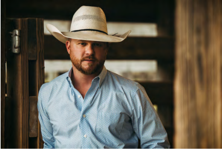
Cody Johnson.

I'm not hearing a lot of playlist essentials among this week's DISCLAIMER candidates.