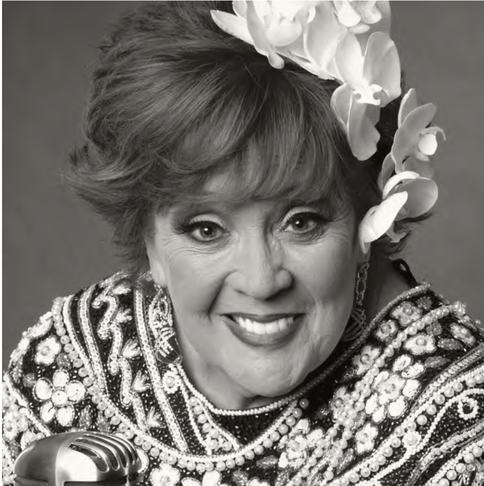
Lulu Roman.

Lulu Roman , the country and gospel music singer, comedian and beloved star of the long-running variety show Hee Haw , passed away on Tuesday (April 23) in Bellingham, Washington. She was 78.