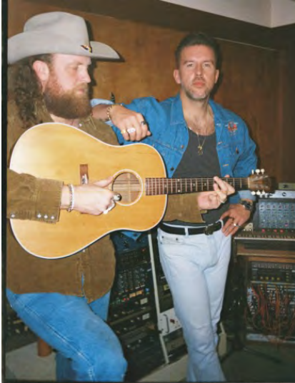
Brothers Osborne.