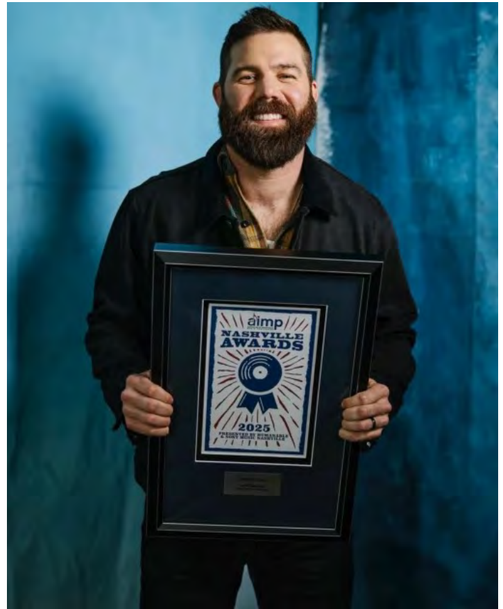
Jordan Davis accepts his award for Artist-Writer of the Year.