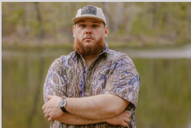
Luke Combs.

Luke Combs has officially spent over a year (53 cumulative weeks) atop Billboard's Country Airplay chart, as his current single, "Ain't No Love In Oklahoma," reaches No. 1 for a second week.