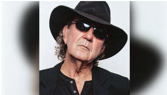
Tony Joe White

The late Tony Joe White has been named the sixth member of the Nashville Songwriters Hall of Fame Class of 2024.