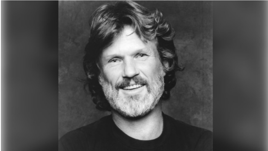
Kris Kristofferson.

Country Music Hall of Fame member Kris Kristofferson passed away at his home in Maui, Hawaii on Saturday (Sept. 28) at age 88.