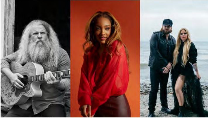
Pictured (L-R): Jamey Johnson, Mickey Guyton, Nate Smith and Avril Lavigne.

Collaborations are the order of the day in this week's DISCLAIMER country music roundup.