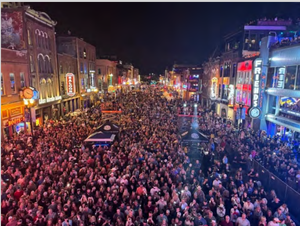
"Brantley Gilbert's World's Largest Album Release Party."

Brantley Gilbert celebrated the release of his seventh studio album, Tattoos , by closing down Nashville's famous Broadway and bringing 118,000 people together for his "World's Largest Album Release Party" last Friday (Sept. 13).