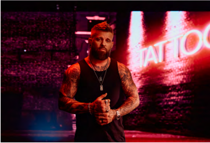
Brantley Gilbert.

It's diversity day in this week's competition for the DISCOVERY Award.