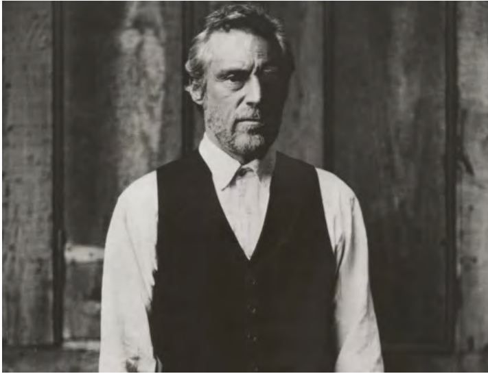
JD Souther.

Songwriters Hall Of Fame member JD Souther passed away on Tuesday (Sept. 17) at age 78. The tunesmith was behind a myriad of hits from the Eagles and Linda Ronstadt, and was a pivotal part of the country-rock sound that reverberated in southern California during the '70s. The Grammy nominee also wrote for country hitmakers Brooks & Dunn, George Strait, Trisha Yearwood, The Chicks and more. As an artist himself, Souther issued several solo albums over the last 20 years. He notched two hits as a solo artist in his career, "You're Only Lonely" in 1979 and "Her Town Too" in 1981 alongside longtime friend James Taylor.