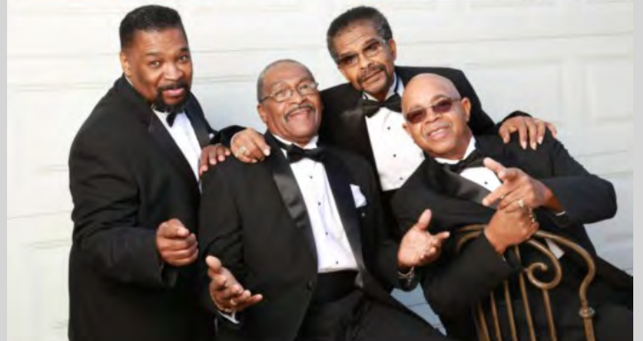
Pictured (L-R, top row): Jimmy Buffett, Bill Cody and Colin Reed; (bottom row): The Fairfield Four