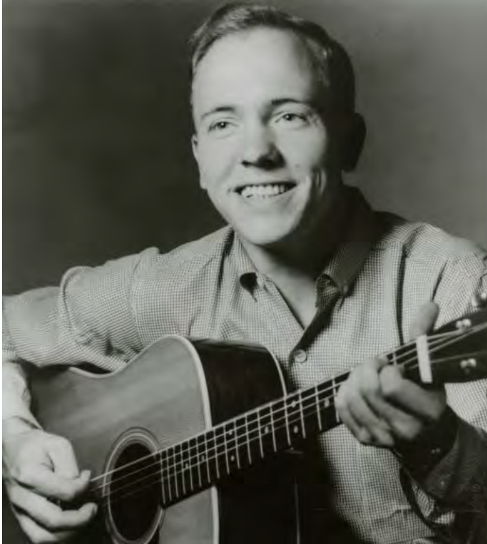
Billy Edd Wheeler.

Known for such hits as “Jackson,” “The Reverend Mr. Black” and “Coward of the County,” Nashville Songwriters Hall of Fame member Billy Edd Wheeler died in North Carolina on Monday (Sept. 16) at age 91. In addition to being an award-winning songwriter, Wheeler was a playwright, an author, a painter and a poet. He was also a former Music Row publishing executive.