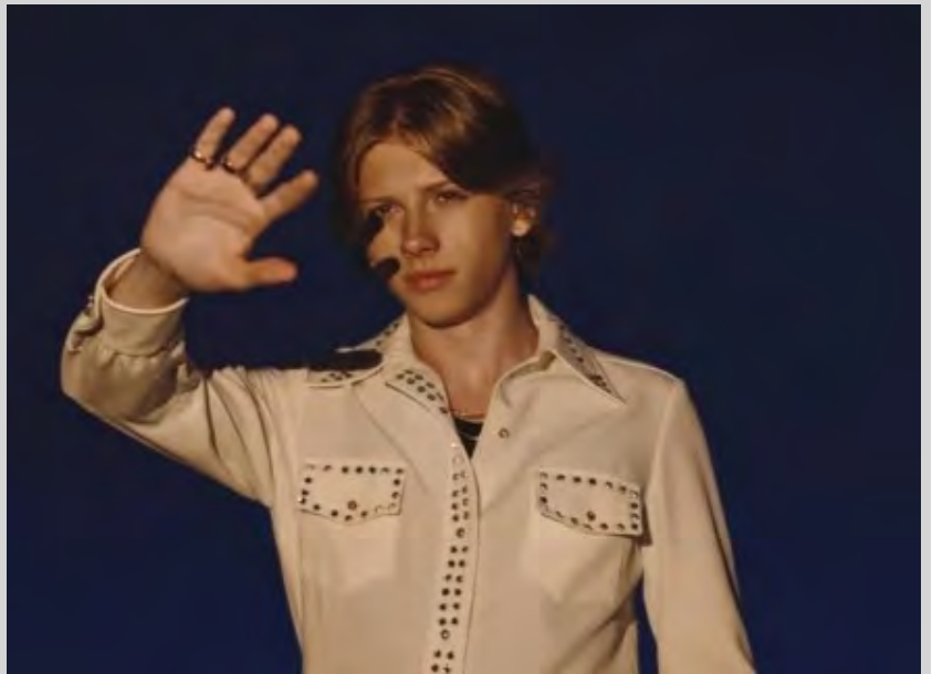
Mason Ramsey.

This kind of recognition will not soon slow down. Since its release in February, Ramsey’s “Blue Over You” has garnered over 18 million streams on Spotify alone. He even joined Grammy Award-winning artist Lana Del Rey on stage at Boston’s Fenway Park to perform the track in July. Adding to this surge, Ramsey was recently featured on the Twisters soundtrack with his song “Shake Shake (All Night Long),” joining stars like Luke Combs, Miranda Lambert, Jelly Roll, Lainey Wilson and more.