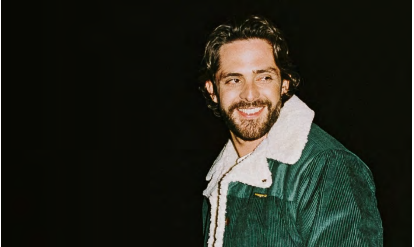
Thomas Rhett.

For more than 10 years, Thomas Rhett has shared his stories through song as heads bob, hips sway and lips belt the lyrics alongside him—leading to 22 No. 1s, 16 billion streams, eight ACM Awards, two CMA Awards, five Grammy nominations and more.