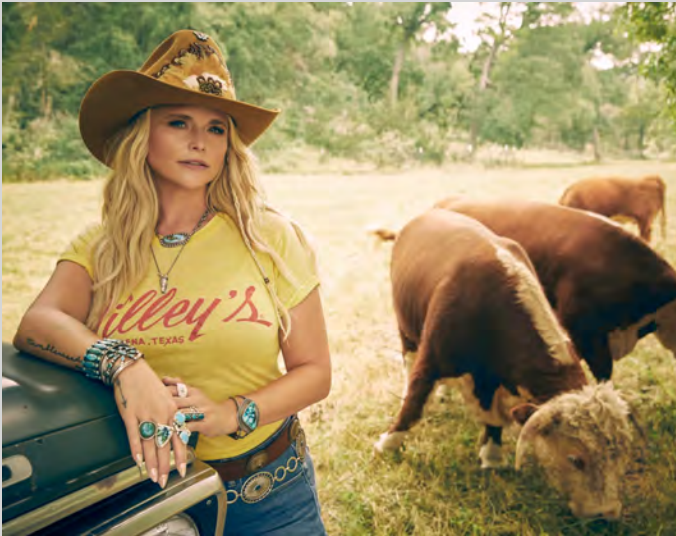
Miranda Lambert.

Miranda Lambert will be honored as this year's Country Icon at the People's Choice Country Awards .