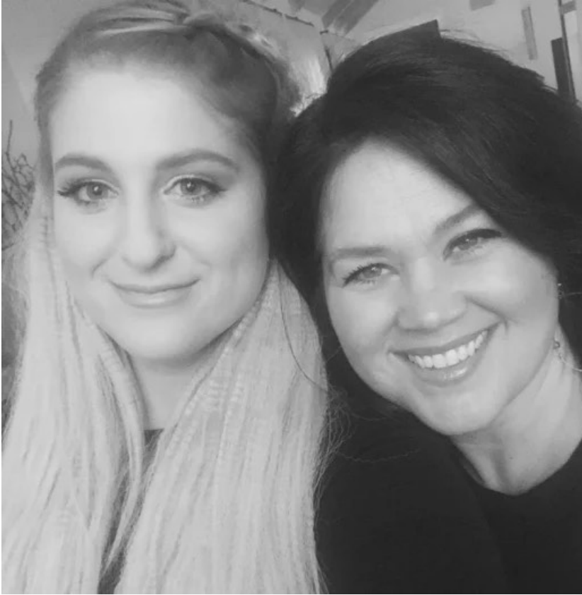
Meghan Trainor & Big Yellow Dog Co-Owner Carla Wallace.

It has been 10 years since the doo-wop-flavored, body positivity anthem “All About That Bass” was the undisputed song of the summer. After its release in June of 2014 via Epic Records, the now Diamond-certified track hit the top of the Billboard Hot 100 chart in Sept. 20, and launched Meghan Trainor 's career into the stratosphere.