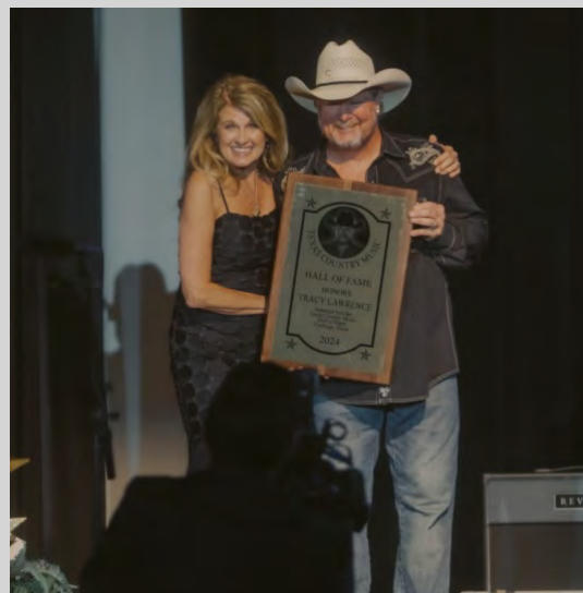
Linda Davis & Tracy Lawrence.

He also recently supported Riley Green's "Ain't My Last Rodeo Tour," while hosting fellow country stars on his TL's Road House podcast and raising money for his Mission:Possible charity. MR