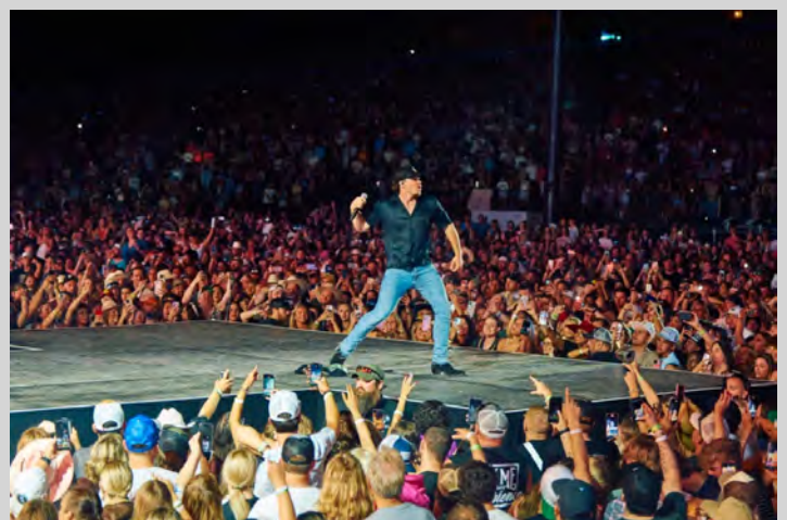
Morgan Wallen plays at Thunder Ridge Nature Arena.

He adds, "If you live in Kansas City, St. Louis or