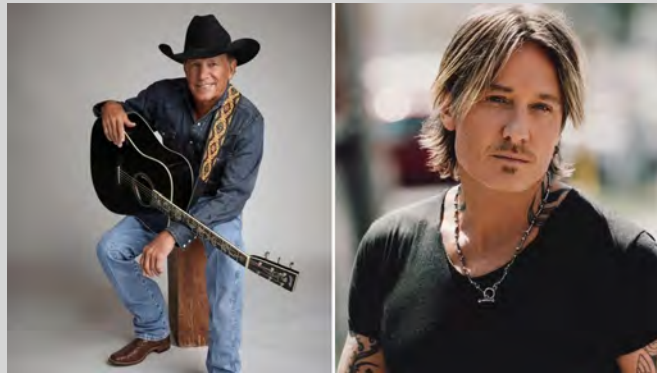
George Strait & Keith Urban

George Strait and Keith Urban are among those set to be honored with a coveted star on the Hollywood Walk of Fame.