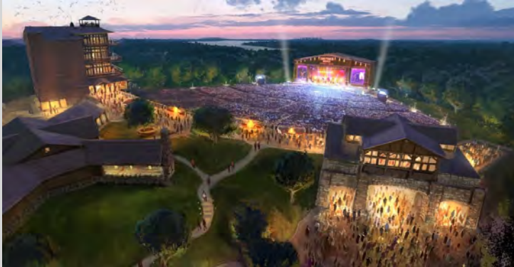
Thunder Ridge art.

There are hundreds of arenas, amphitheaters and rooms of various sizes across the nation that house memorable concerts every night, but there are only a handful of venues that reach icon status. Going to see a show at Red Rocks Amphitheatre, The Hollywood Bowl or the Ryman Auditorium, for example, are experiences that make a lot of music lovers' bucket lists.