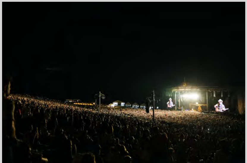
Chris Stapleton plays at Thunder Ridge Nature Arena.

“Pictures are one thing, but you have to get out there. Having that big reveal when you come around the bend and see everything...I can’t put that into words,” he says. “In our business, there are so many shows and so many venues. The venues like Thunder Ridge are the exceptions to the rule. There’s a story behind it and deep meaning. You need to experience this in person because it is unlike anything that you have been a part of.” MR