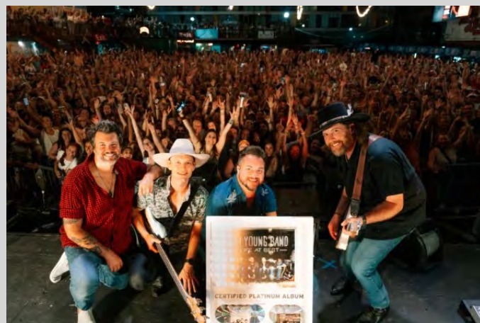
Eli Young Band with their new plaques onstage.

Country act Eli Young Band was greeted with custom plaques celebrating their Platinum album Life At Best as well as five-time Platinum single "Crazy Girl" and triple-Platinum chart-topper "Even If It Breaks Your Heart" when they visited the Recording Industry Association of America (RIAA) headquarters this week ahead of their sold-out "10 Years: 10,000 Towns Tour" stop in Washington, D.C.