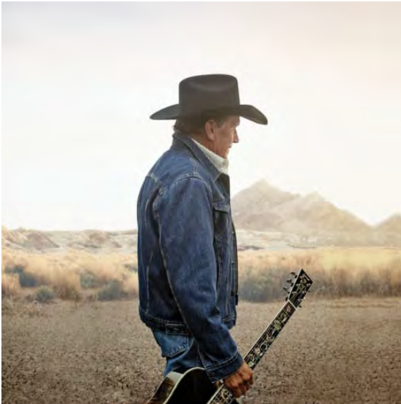
George Strait.

Traditional country music asserts its lasting appeal in this week's DISCLAIMER column.