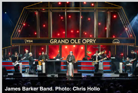
James Barker Band.

James Barker Band made their Grand Ole Opry debut on Tuesday (Feb. 27).