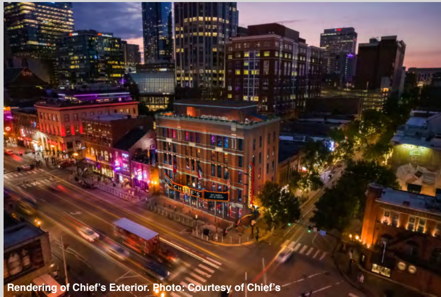
Rendering of Chief's Exterior.

To thank his longtime supporters, Eric Church has given fans deeds to the individual bricks that form his new restaurant and live music venue in downtown Nashville, Chief's.