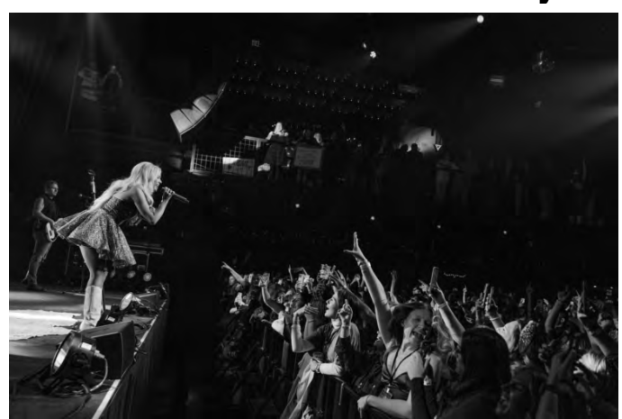
Megan Moroney performs during her sold-out show at Brooklyn Bowl Nashville.

Megan Moroney shimmered and shined during her soldout show at Brooklyn Bowl Nashville on Thursday night (Dec. 7). "The Lucky Tour" stop also marked milestone moments for the up-and-coming star. Splashes of pink light and disco ball reflections swirled as the unforgettable night unfolded.