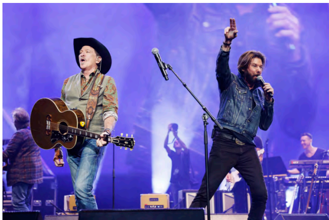
Kix Brooks and Ronnie Dunn of Brooks & Dunn perform onstage for "All For The Hall."