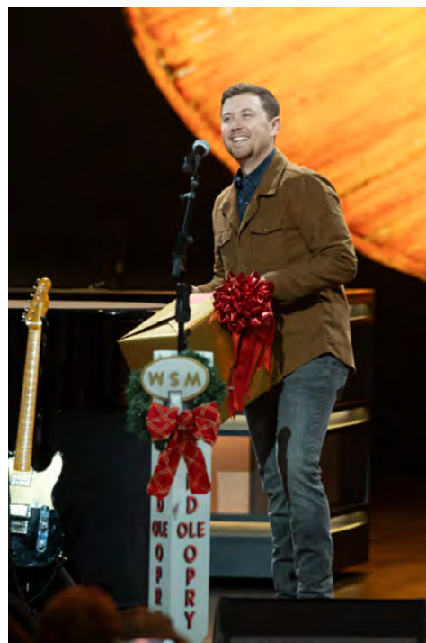
Scotty McCreery invited to become a member of the Grand Ole Opry.

"Holy cow. Yes, I would love to," McCreery replied. "I grew up listening to your records