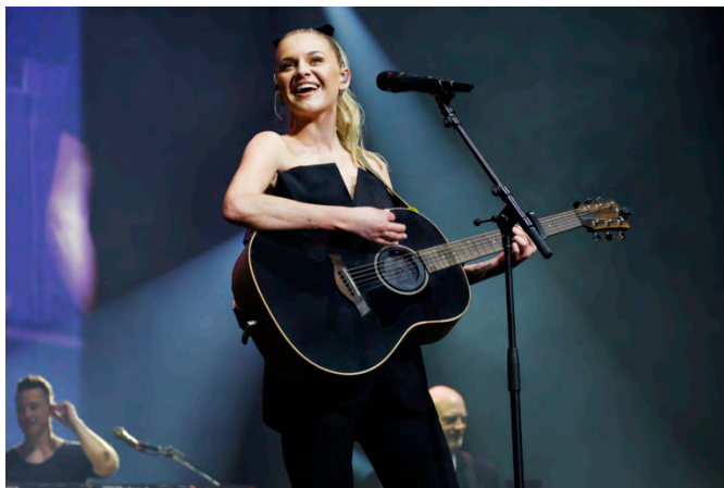
Kelsea Ballerini performs onstage for "All For The Hall."