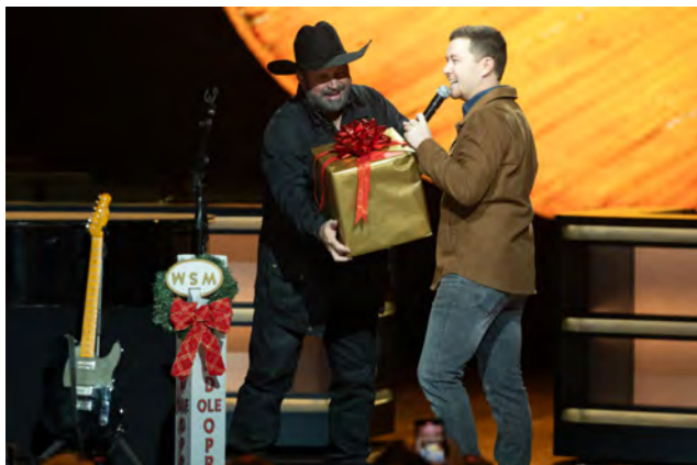
Garth Brooks invite Scotty McCreery to become a member of the Grand Ole Opry.

Garth and you're a part of what made me want to do this for a living and I didn't think that dream would become a reality, but it is because of all of y'all sitting in this house tonight. God bless y'all.