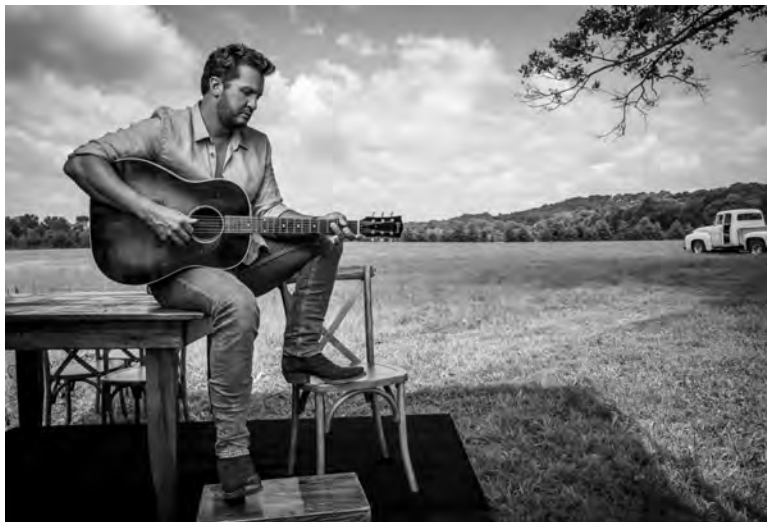
Luke Bryan.

This productive listening session perfectly mixed country newcomers and stars.