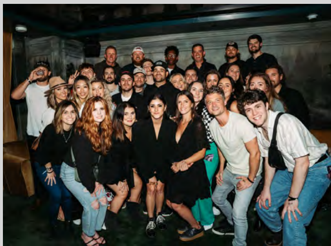
Pictured: Why&How Staff and Artists Celebrate Together at the Twelve Thirty Club in Nashville on Oct. 5 following Breland's Sold-Out Show at the High Watt.