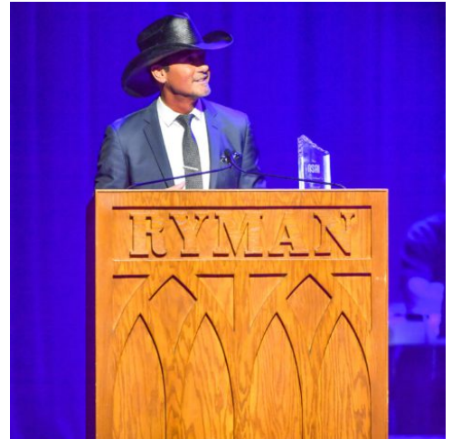
2023 NSAI President's Keystone Award recipient Tim McGraw.