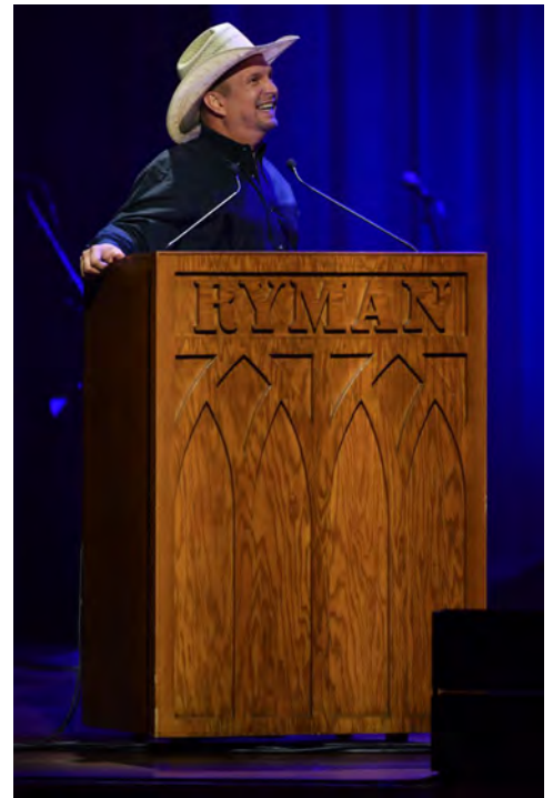
Garth Brooks accepting the Kris Kristofferson Lifetime Achievement Award.