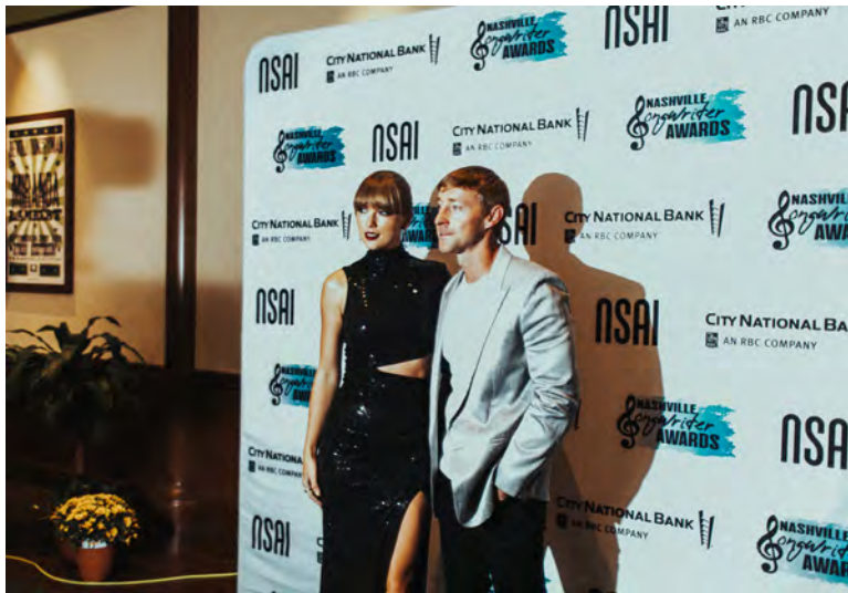
Decade honorees Taylor Swift (Songwriter-Artist of the Decade) and Ashley Gorley (Songwriter of the Decade) pictured on the red carpet.

The annual Nashville Songwriters Association International (NSAI) songwriter awards honored nearly 40 writers Tuesday evening (Sept. 20) during a four-hour extravaganza staged at the Ryman Auditorium.