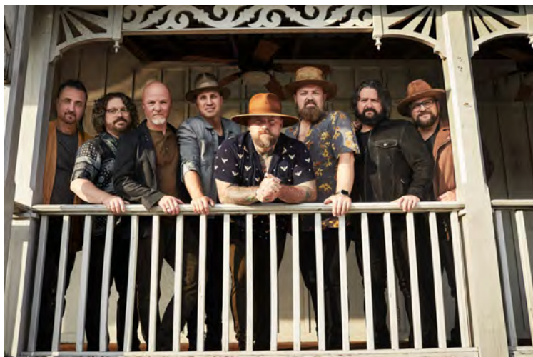
Zac Brown Band.

For-real country music returns with a vengeance in this week's DISClaimer column.