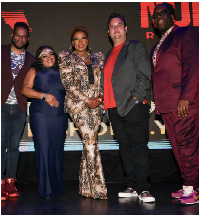
Gina Miller and team