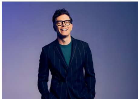
Bobby Bones.

Award-winning radio personality Bobby Bones , host of the hit national country radio program The Bobby Bones Show, has renewed his relationship with iHeartMedia.