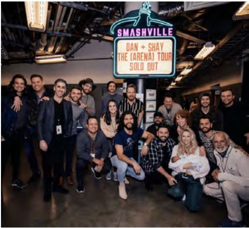
Backstage at Dan + Shay's "The (Arena) Tour" stop at Nashville's Bridgestone Arena