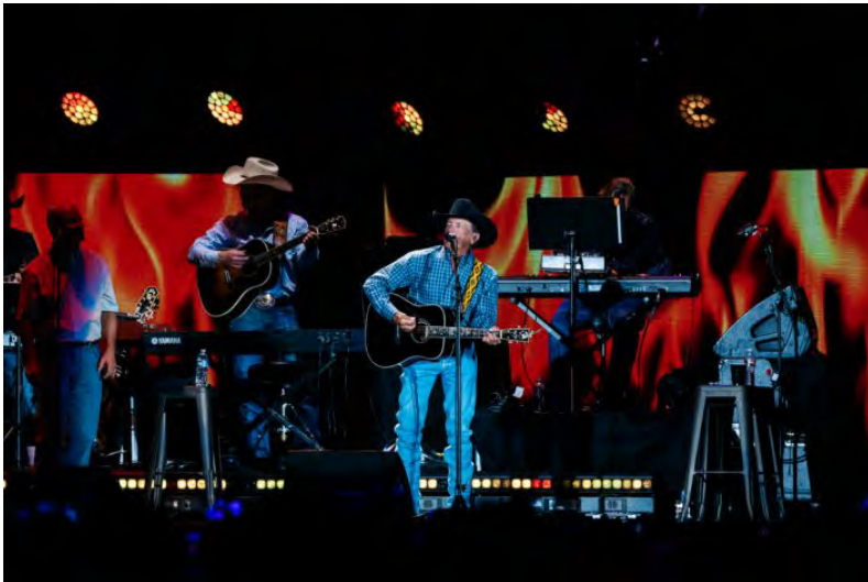
George Strait performs at Nissan Stadium. and "Day Drinking."

Saturday night (July 29) in Nashville was a wash out, but before the torrential downpour began, fans came out in droves to Nissan Stadium to see the king of country music, George Strait.