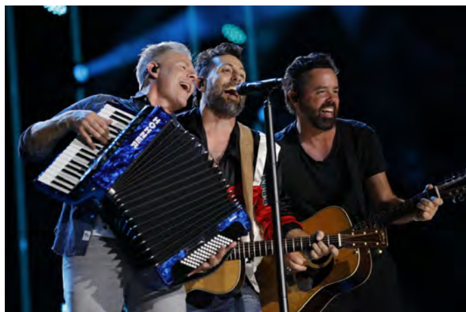
Old Dominion performs at Nissan Stadium on Saturday, June 10 during CMA Fest 2023 in downtown Nashville.