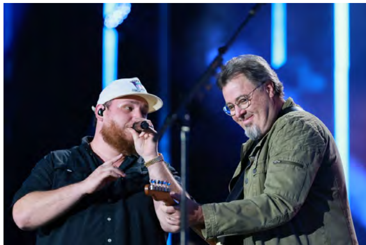
Luke Combs and Vince Gill perform at Nissan Stadium on Thursday, June 8 during CMA Fest 2023 in downtown Nashville.