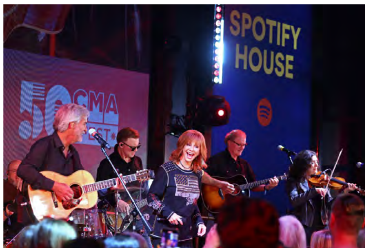
Reba McEntire performs onstage at Spotify House during CMA Fest 2023.