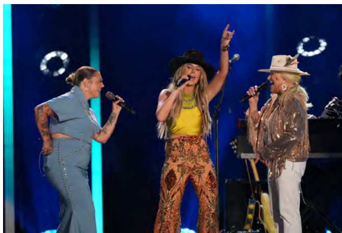
Elle King and Tanya Tucker perform with Lainey Wilson at Nissan Stadium on Friday, June 9 during CMA Fest 2023 in downtown Nashville.