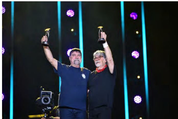
Alabama performs at Nissan Stadium on Sunday, June 11 during CMA Fest 2023 in downtown Nashville.

Ticket proceeds directly benefit music education initiatives across the country through the CMA Foundation. This year, CMA will donate $2.5 million to the CMA Foundation. Additionally, the three-hour primetime concert special CMA Fest was filmed during this year's festival and will air July 19 on ABC. MR