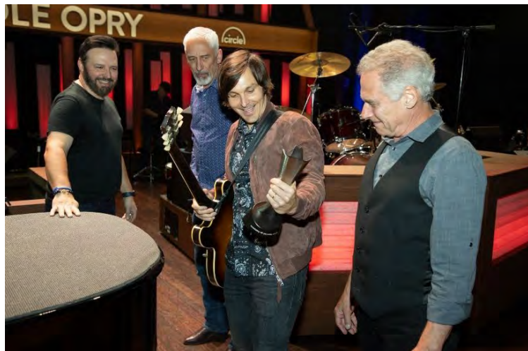
Pictured: Charlie Worsham with his first ACM Award on stage during Friday's Grand Ole Opry.

The Academy of Country Music announced the Industry and Studio Recording Award winners from the 57th ACM Awards at the Grand Ole Opry House on Friday night (May 13).