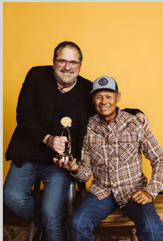
Bob DiPiero pictured with Neal McCoy who performed "Wink!" in his honor.