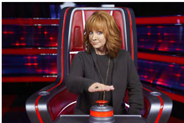
Reba McEntire.

Reba McEntire will bring her decades of experience from her iconic career to NBC's The Voice , stepping in as a coach for season 24.