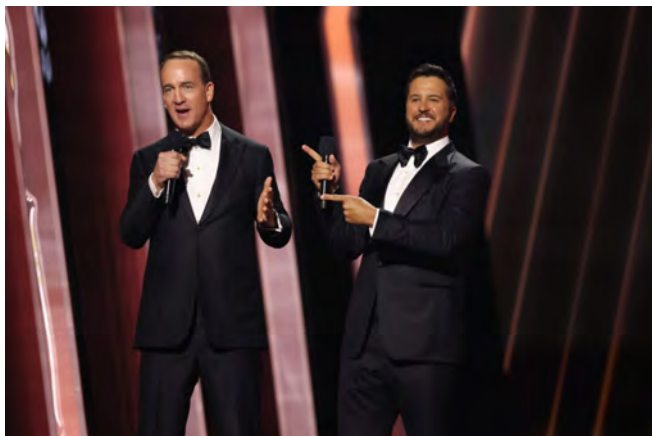
Luke Bryan and Peyton Manning hosting the 56th Annual CMA Awards.

Two-time CMA Entertainer of the Year Luke Bryan and NFL star Peyton Manning will return as hosts for the 57th Annual CMA Awards, which is set to air live from Nashville's Bridgestone Arena on Wednesday, Nov. 8 at 8 p.m. ET/7 p.m. CT on ABC.