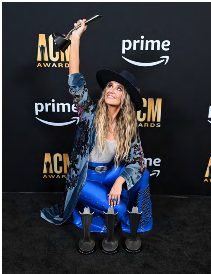
Lainey Wilson with her four ACM Awards.