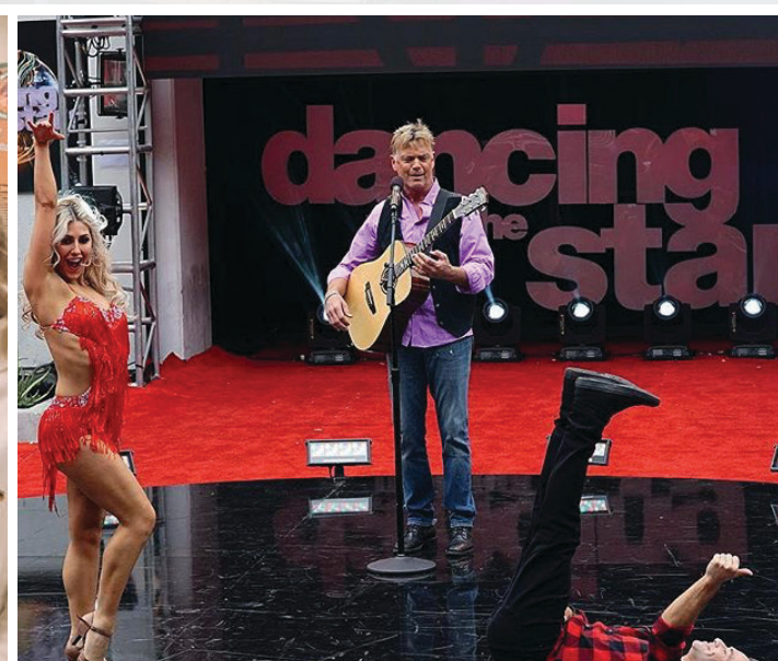
Pictured: John Schneider performs his new single "Walk A Mile In My Shoes" on the Dancing With The Stars finale with dancers Emma Slater and Sasha Farber.