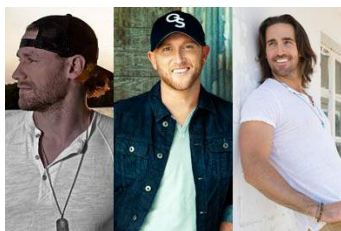
L-R: Rice, Swindell, Owen

Kenny Chesney has always brought acts he's believed in out on the road. His 2015 The Big Revival Tour is no different as Chesney brings on labelmate Jake Owen , MusicRow's 2014 Breakthrough Songwriter winner Cole Swindell , and Chase Rice for what will be one of the summer's best parties.