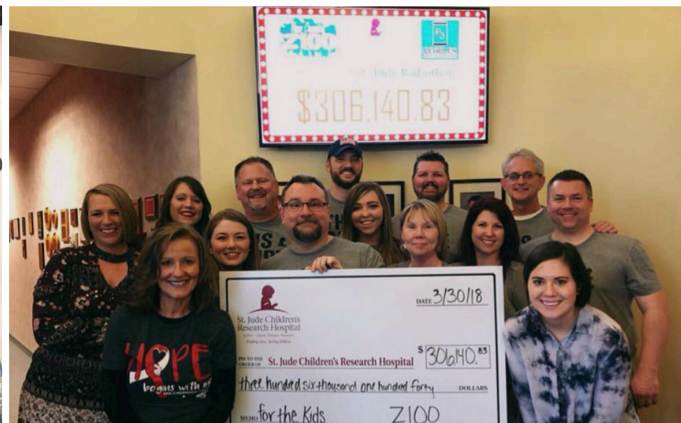
Pictured: The Z100/Carterville, IL team recently held a radiothon and raised over $300,000 for St. Jude Children's Research Hospital.